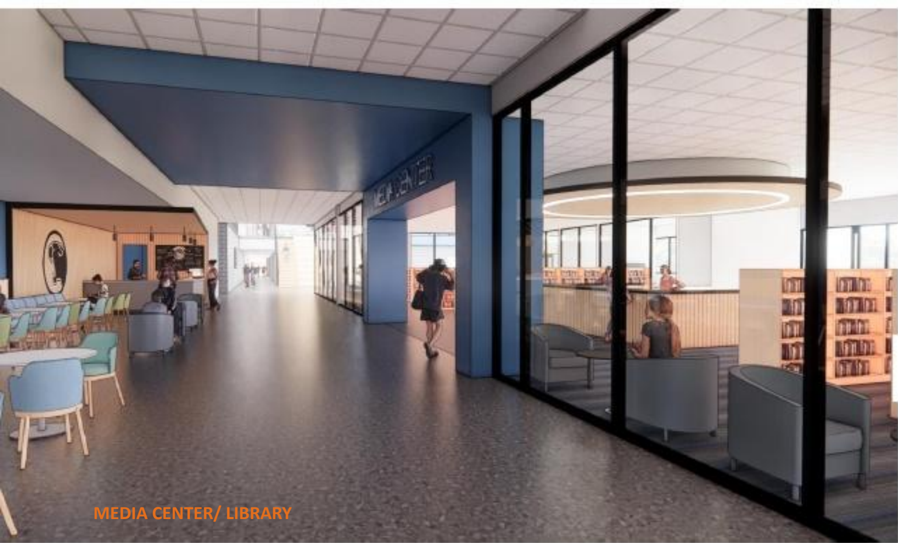
MEDIA CENTER/ LIBRARY