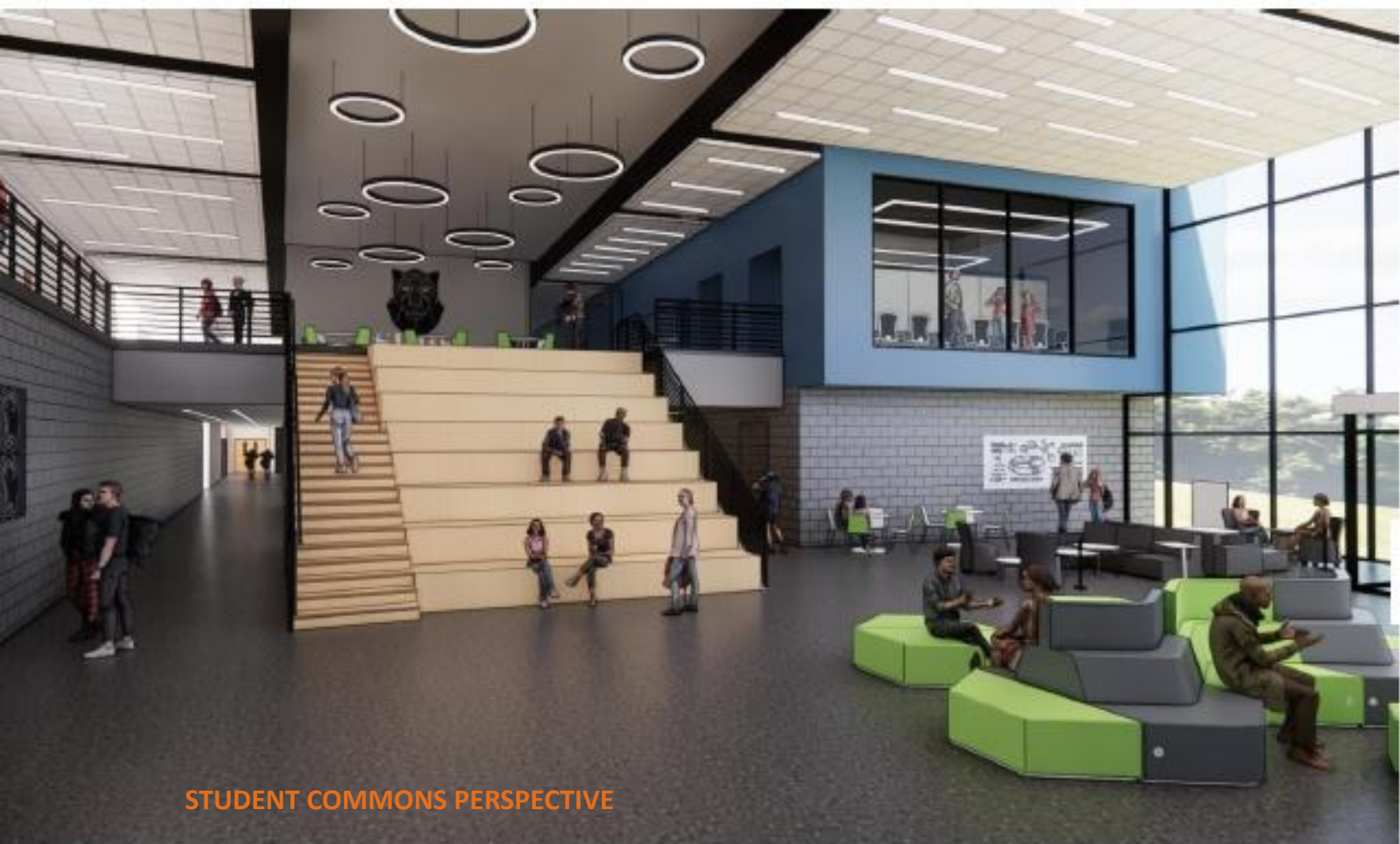
STUDENT COMMONS PERSPECTIVE